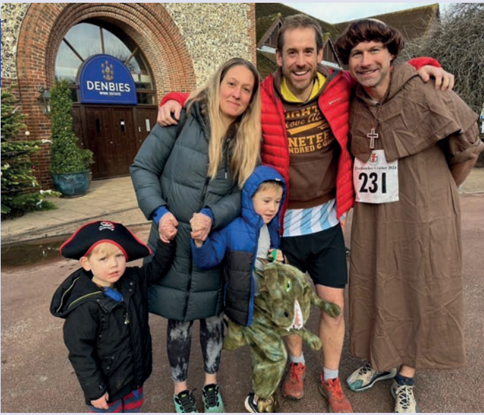
ARG runners at a local race