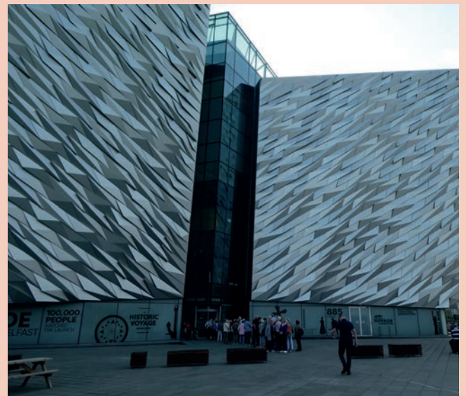
ASA members queue for the Titanic museum in Belfast

Secondly, our ever-popular Christmas Dinner was well-received by over a hundred members and guests, who also enjoyed a hilarious talk about the cartoonist Giles. 2024 has kicked off with more fascinating lectures on subjects such as Dame Laura Knight, Sporting Architecture, and Caravaggio. For the Autumn we are planning another five-day cultural holiday, to Devon and Cornwall, based in Plymouth.