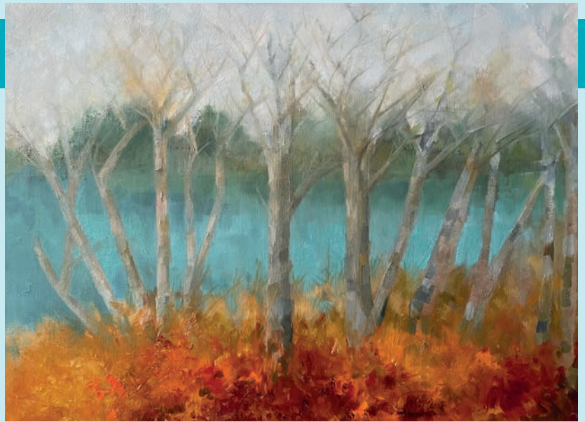
"Autumn Contemplation" by Elaine Baigrie