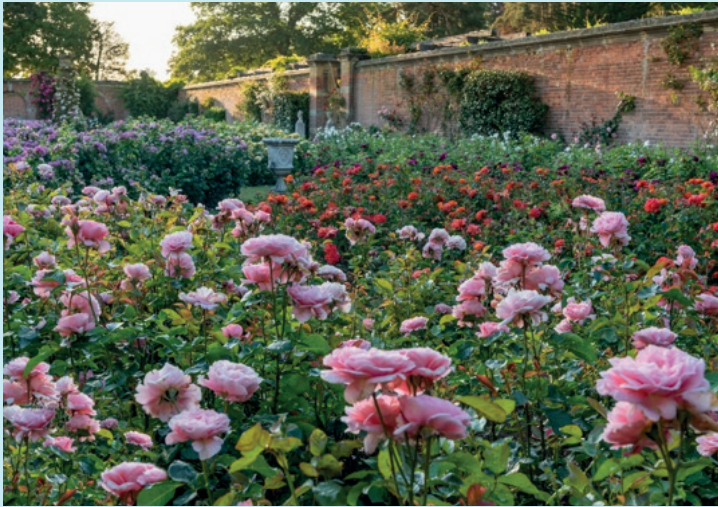
The Rose Garden, Hever Castle

With the first signs of Spring all around us, Ashtead Horticultural Society is looking forward to an active year in 2024. We have a great selection of evening talks, a coach trip to the home of Anne Boleyn, and two horticultural shows where members can demonstrate their gardening expertise.