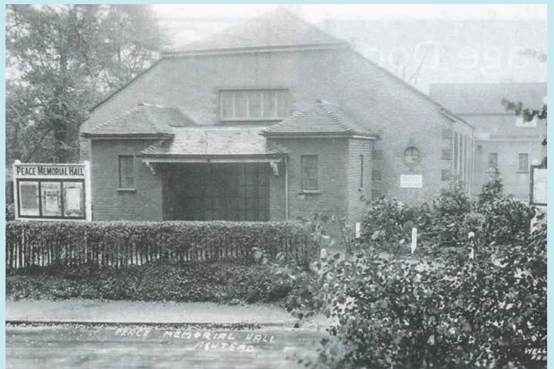
Ashted Peace Memorial Hall has been the hub of the community since 1924