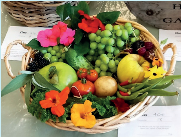
A beautiful basket of flowers, fruit and vegetables in our 2023 Autumn Show

Our 139th Summer Show will be on 20th July and the 71st Autumn Show will be on 7th September, both in Ashtead Peace Memorial Hall. Other events during the year include our Coffee & Cake Morning on 18th May, which includes a plant sale, and will be in a private garden in Grays Lane. On 19th June we have a coach outing to Hever Castle Gardens, the home of Anne Boleyn and subsequently, in the 1900s, of William Waldorf Astor who commissioned extensive work on the gardens including the manual excavation of the 38-acre lake. On 24th July there will be a Garden Walk to 3 private gardens in the area of Church Road, Oakfield Road and Greville Park Avenue.