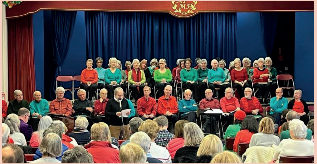
Ashtead Choral Society – "Carols for Charity", December 2023