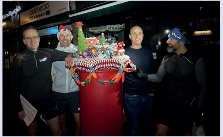
... and on a caroling run before Christmas!

ARG is an informal group of local runners that goes out in all weathers, throughout the year, to explore the paths and bridleways surrounding our excellent village.