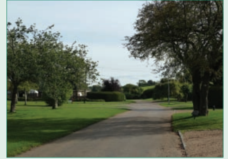
View beyond village, from Grays Lane

either side of the road, these create a strong landscape setting, within which the dwellings themselves are often a subservient element.