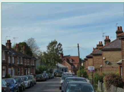
Housing near Village Centre