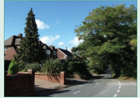
Larger Houses, Dene Road