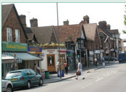
Shops on The Street