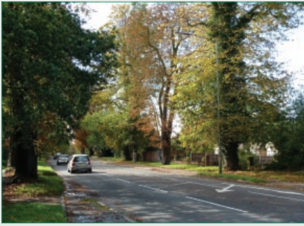
Tree-lined Epsom Road