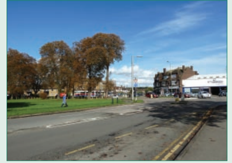
Craddocks Parade from pond

Currently vacant site at former filling station on north side of The Street.