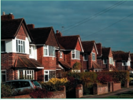
Street scene, Broadhurst