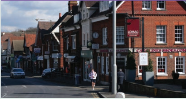
The Street, Ashtead