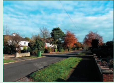
Links Road general view