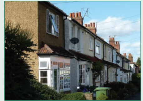
Caen Wood Road