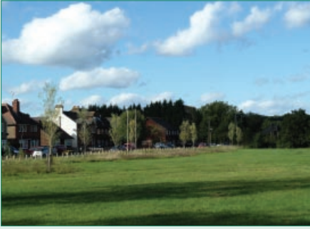
Housing on edge of Woodfield