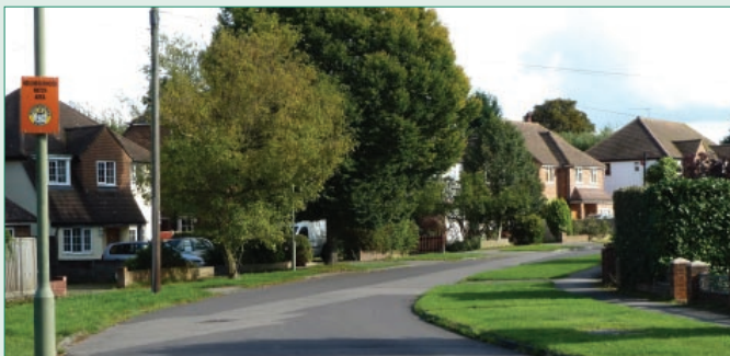
Mixed house designs, Hillside