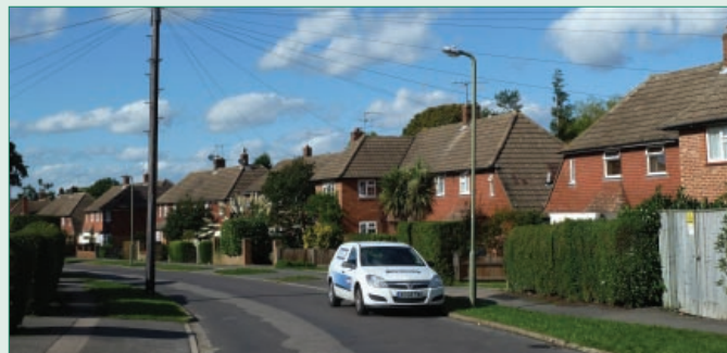
1950's housing, Berry Meade