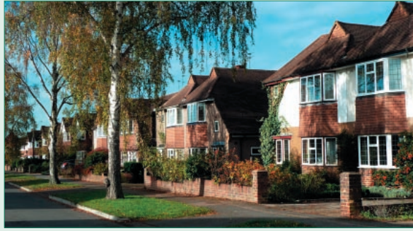
Street scene, Overdale