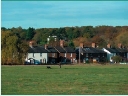
Cottages fronting Common