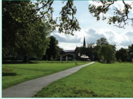
St George's Christian Centre from Woodfield