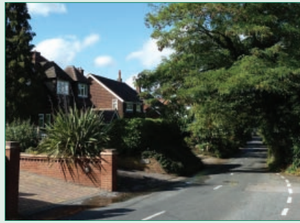
Larger houses in The Lanes