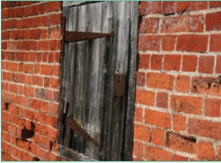
Brick Wall Parkers Lane