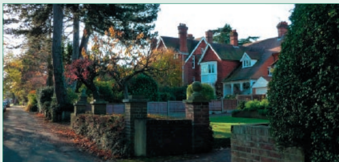
Conservation Area, Woodfield Lane