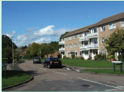
Flats at Flower Court