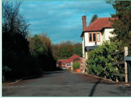
Infill off Links Road