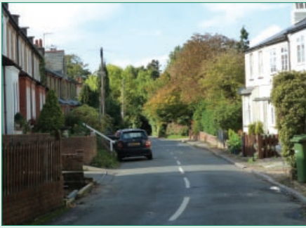
Cottages in The Lanes