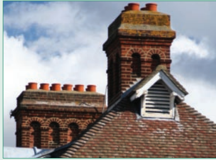
Chimneys in the Street