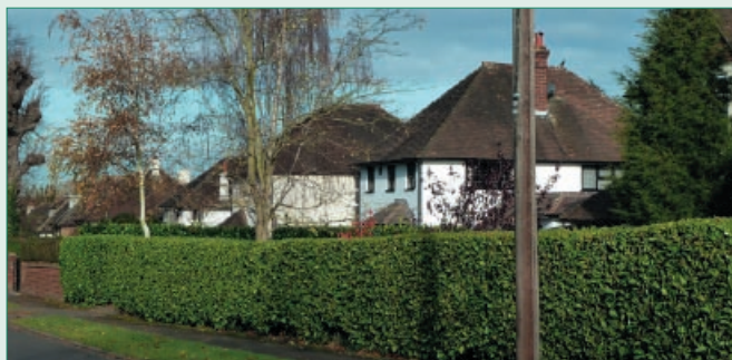
Low Density Housing, Greville Park Road